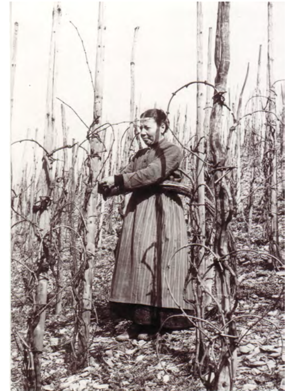
OLD SCHOOL Training Riesling vines on single poles. The photograph dates to early in the 20th century.

COVER PHOTOGRAPH The Ayler Kupp, a vertical patchwork of Riesling vines, in the late 1930's.