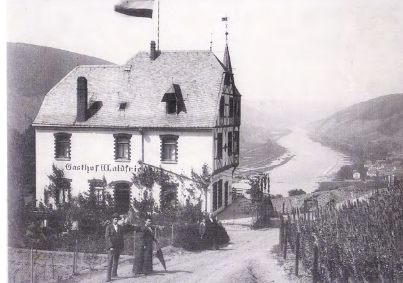
wine on the Mosel.

And it was by no means easy to suddenly begin producing dry wine. The reductive style that is typical for making sweet wines—early doses of sulfur, early filtration—is not necessarily appropriate for dry wines. The increasingly high yields (often well over 100 hl/ha) of the 1960s and 1970s, and especially the dramatic mass production of 1982 and 1983, were too large to allow for well-balanced, structured, and ripe dry wines. Growers were forced to re-orient their thinking toward consistently limited yields. All of a sudden it had become clear why, in comparison to those with residual sugar, dry wines had for so long been judged unfavorably: the high yields that played quite well to the strengths of sweet wines left dry ones tasting sharp, thin, and sour. With gradual